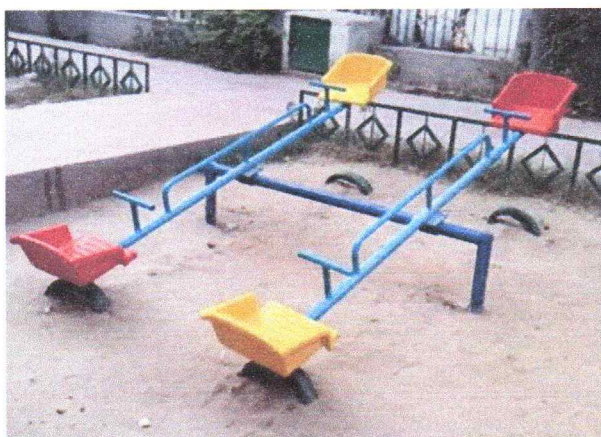
See Saw (4 Seater)