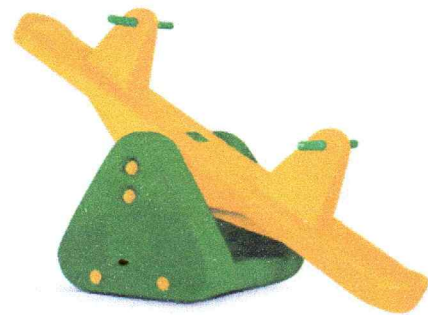
See Saw (Rocker)