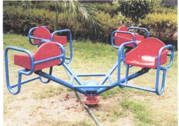
MGR (4 Seater)