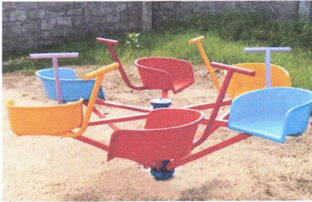
MGR (6 Seater)